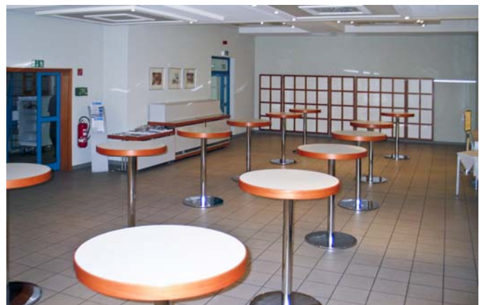
The auditorium next to the seminar rooms offers flexible alternatives for the accompanying exhibition.